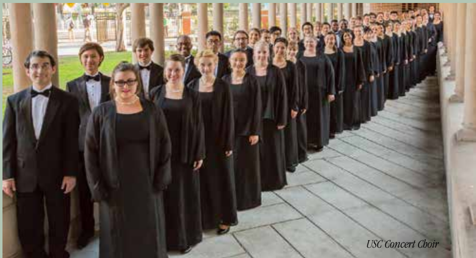
USC Concert Choir

anniversary of Polish independence. Recipients of the 2015 American Prize in Choral Music, the Chamber Singers have performed for the American Choral Directors Association conferences and the World Symposium of Choral Music in Seoul, Korea. The Concert Choir has appeared at Walt Disney Concert Hall, the Segerstrom Center for the Arts and the National Collegiate Choral Organization's annual conference.