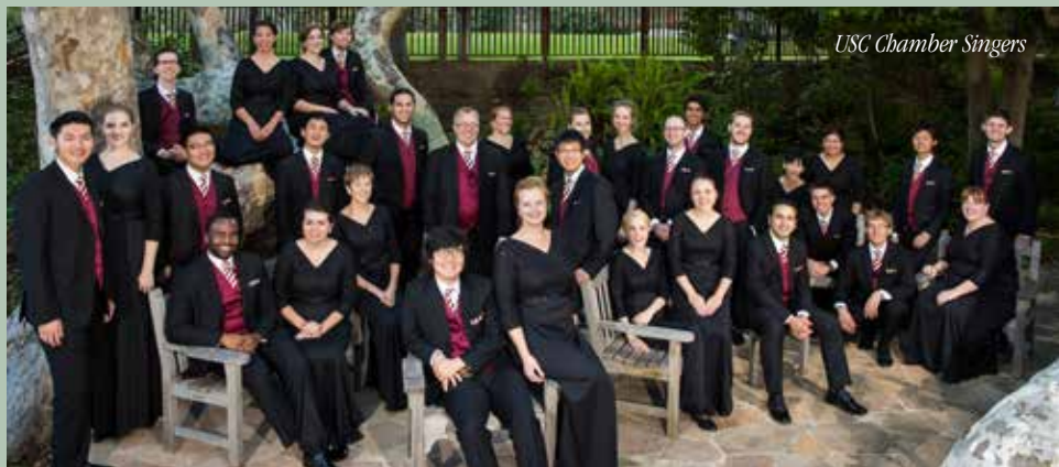
USC Chamber Singers